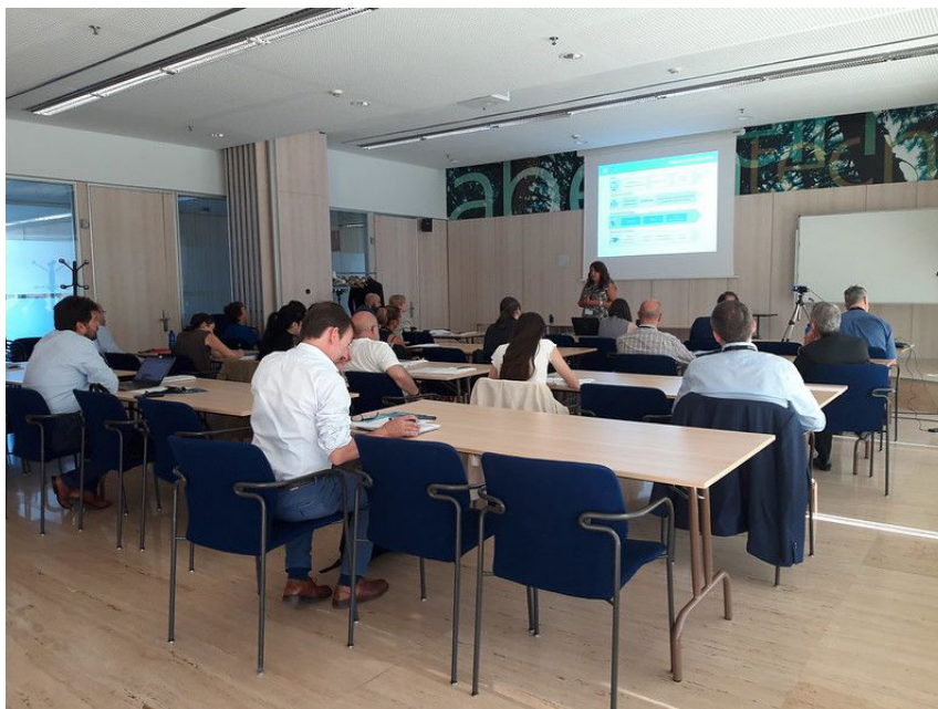
The DIH-HERO Infoday at Tecnalia

Furthermore every hub organized regional Info-days where SMEs got invited to be informed about the cascade funding and application opportunities.