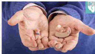
I nuovi rivoluzionari apparecchi acustici che stanno spopolando in Italia

Milano, 19 mag. (Adnkronos) – Sono stati presentati i risultati del progetto 'Sidera^B', una piattaforma tecnologica di servizi integrata con una serie di strumenti per l'erogazione di attività motorio-cognitive di riabilitazione (applicazioni multimediali e video game), alcuni indossabili, per il monitoraggio dell'attività fisica, ma anche del sonno.